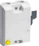
BW325 L TPN