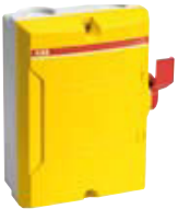
BW325 Y DP