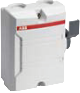
BW225 W DP, BW325 W TPN