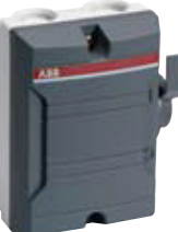
BW240 DP, BW340 TPN, BW440 TPSN