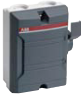
BW225 DP, BW325 TPN BW425 TPSN