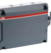
BW625 TPN, BW640 TPN