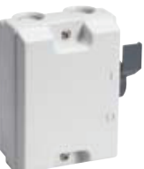
BW325 K TPN